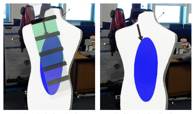
(a) Detailed Visualisation